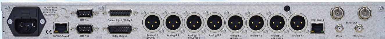
Rear view FlexDSR04+ DVB Satellite Receiver